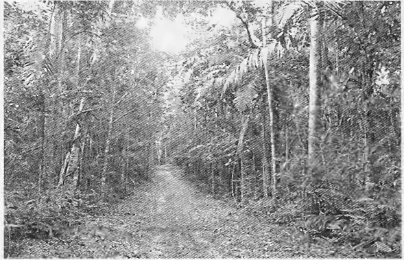
Figure 2. Quirinão trail, Sooretama Biological Reserve (19°03'S, 40°08'W), Espírito Santo, Brazil (Thiago V. V. Costa)

Field work was carried out using binoculars, digital recorders (Sony PCM-D50 and Sound Device) and Sennheiser ME66 microphones, and an iPod and Altec Lansing IM237 speaker for playback. Recordings of N. leucopterus used in playback are those presented by Naka et al. (2008).